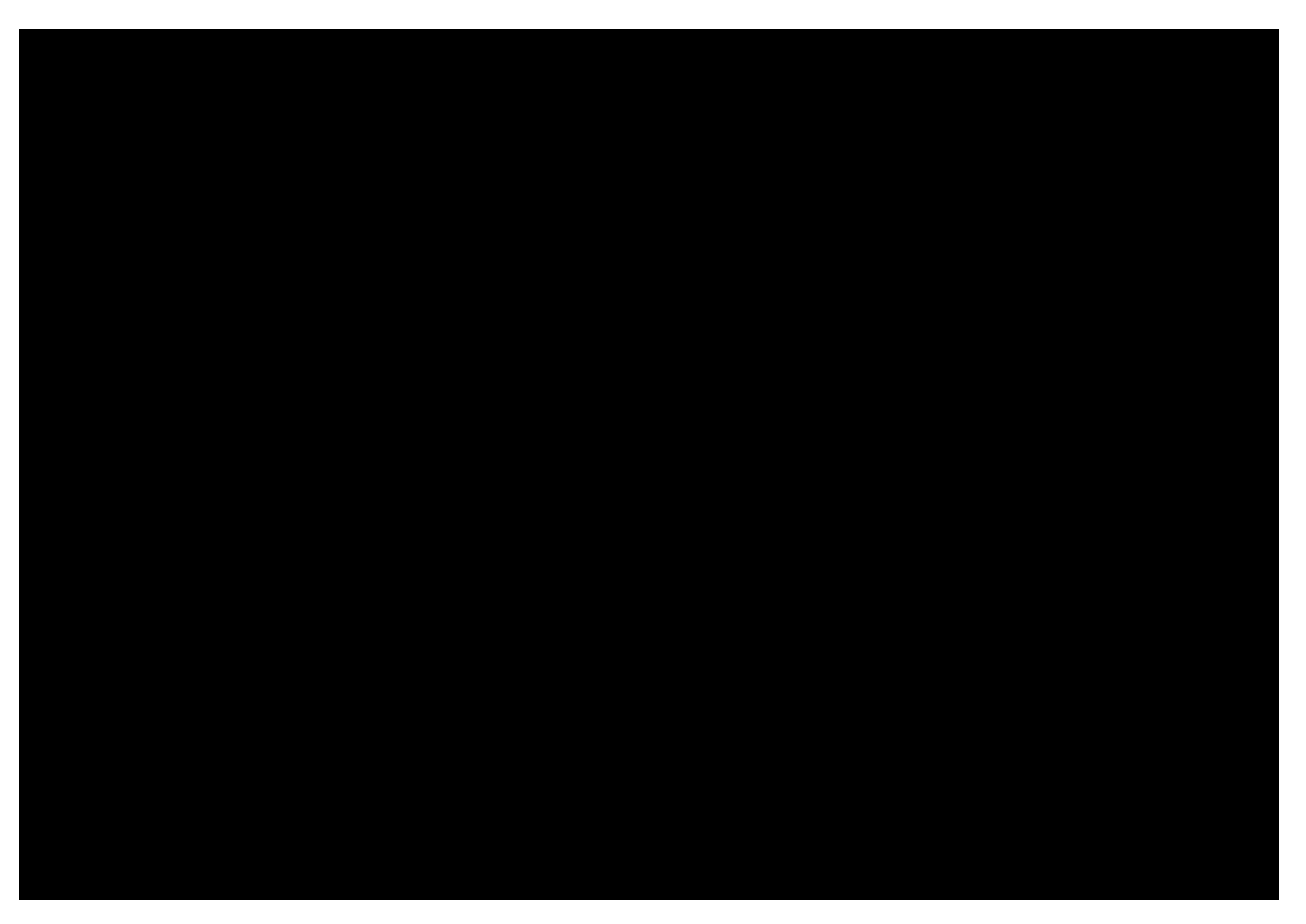
Figure 2: Draft Land Zoning Map

Pursuant to Draft State Environmental Planning Policy (Western Sydney Aerotropolis) 2019, under the proposed mixed use zone land uses such as: Attached Dwelling, Backpackers Accommodation, Boarding House, Business Identification Sign, Car Park, Commercial Premises, Community Facility, Early Education And Care Facility, Educational Establishment, Electricity Generating Works, Emergency Services Facility, Entertainment Facility, Environmental Facility, Environmental Protection Works, Flood Mitigation Work, Function Centre, General Industry, Group Home, Health Services Facilities, Home Industry, Hostel, Hotel Or Motel Accommodation, Industrial Training Facility, Information And Education Facility, Light Industry, Multi Dwelling Housing, Passenger Transport Facility, Places Of Public Worship, Public Administration Building, Pubs, Recreation Areas, Recreation Facility (Indoor), Recreation Facility (Major), Registered Club, Residential Care Facility, Residential Flat Building, Respite Day Care Centre, Road, Semi-Detached Dwelling, Service Station, Serviced Apartment, Sex Services Premises, Shop Top Housing, Storage Premises, Telecommunications Facility, Vehicle Repair Station, Veterinary Hospital are permitted with the consent of determining authority such as the Local Council.