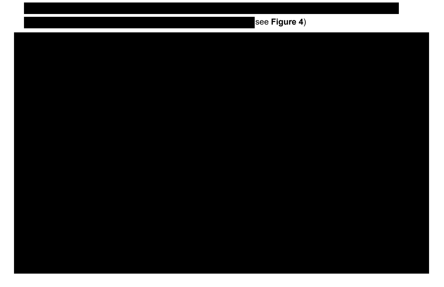
Figure 4: Blue Green Infrastructure

Section 4 of the Western Sydney Aerotropolis Plan introduces the Blue-Green Grid concept as a network of waterways, riparian areas, bushland, parks and open spaces, tree canopy (including street trees) and private gardens that are strategically planned, designed and managed to support a good quality of life in an urban environment.